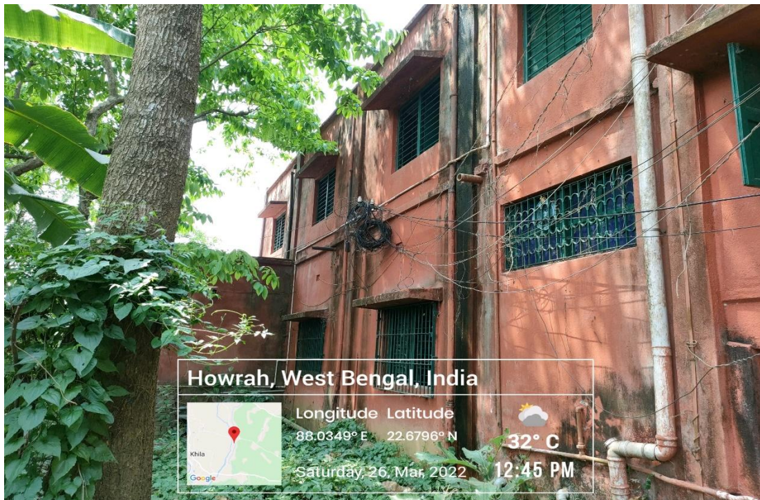
Segregation of chemical waste and ordinary waste